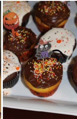
October-Our 1st "Evening" Meeting at the SAI Office