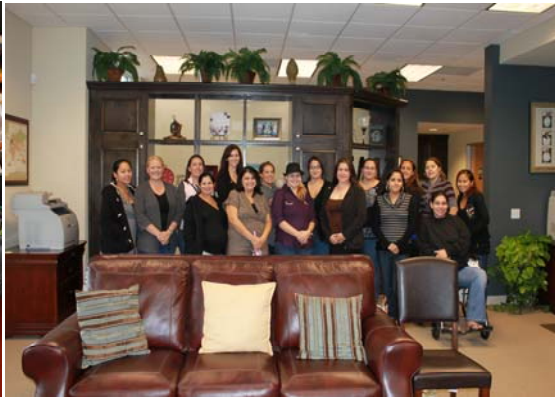
October-Our 1st "Day" Meeting at the SAI Office