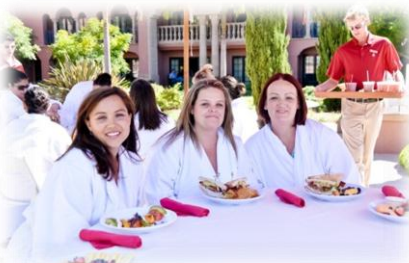
Lunch is served