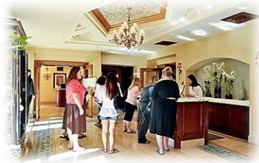
The Spa is beautiful!

Surrogate Alternatives had robes embroidered to commemorate the event for all of the surrogates. Lunch was catered by the hotel and we took the girls to dinner after their full day of pampering. Nothing is better than sitting in the spa, sauna or by the pool-just RELAXING ©