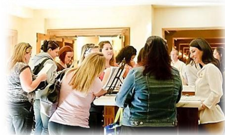
The girls checking in for their services